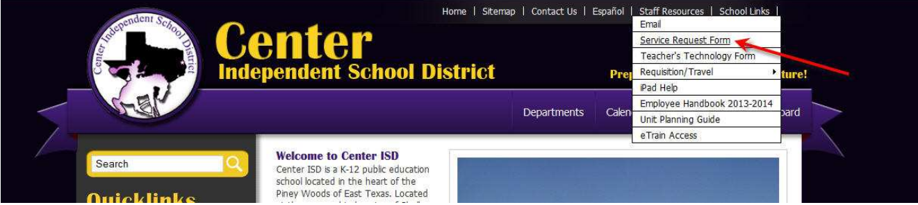
Center ISD District Home Page

For your convenience, we have provided an online service request form that allows you to request services when you have a technology or maintenance problem. All service requests are forwarded to Technology for a scheduled response. We encourage you to use the service request system to ensure a timely response.